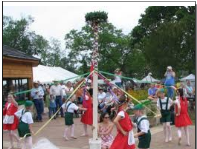
Brenham Maifest, Texas, a community-wide celebration of local German heritage.

VON-MASZEWSKI: The Old German script was in vogue until the mid-1930s. As a 15-year old I taught myself in the early 1950s to read the script, never suspecting that down the road it would come to good use to me. In the 1980s I was researching the history of the Brenham Maifest, an annual festival still observed in Brenham, Texas. I located an early document of the sponsoring organization at Blinn College, Brenham, Texas.