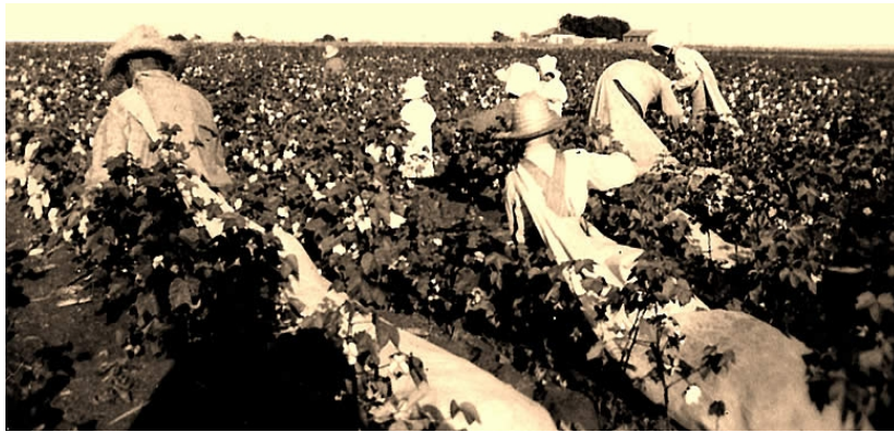
Picking cotton by hand.

ROGERS: Cotton was the main crop. Chopping and picking cotton. Chopping with a hoe when the crop was small and when it grew then you would pick it.