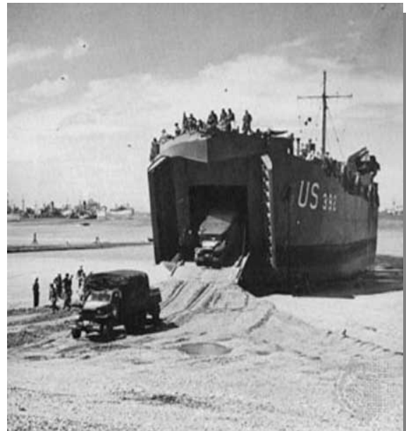
US Army trucks leaving an LST at Normandy landing beach.