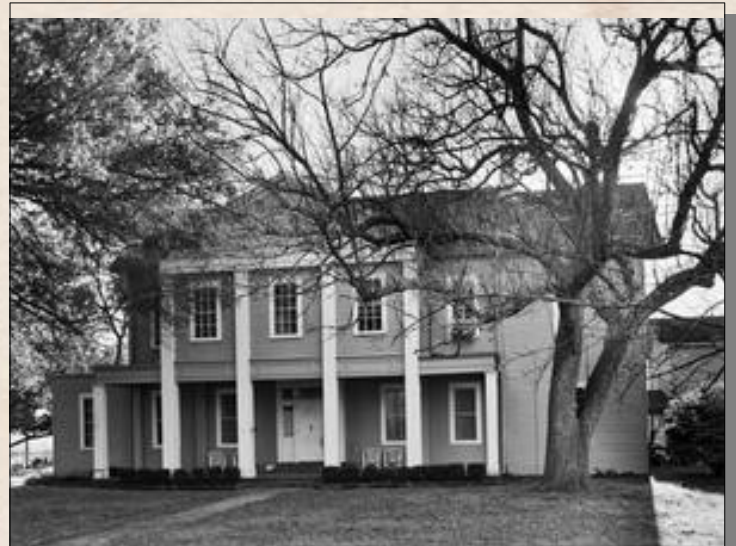
The Dew House ca. 1980