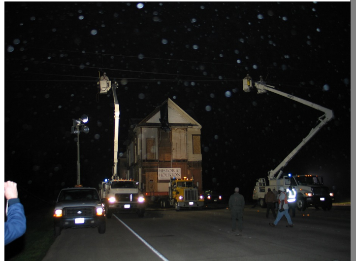
CenterPoint Energy directed the highway move, with TXDOT concurrence, to assure public safety as well as the safety of the contractor and for the protection of the house.