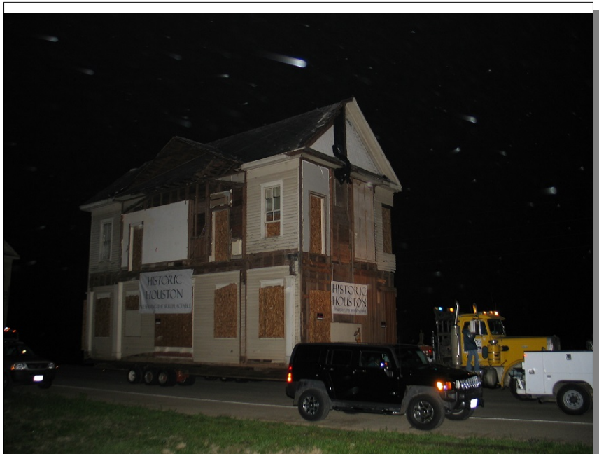
Missouri City law enforcement routed traffic around Highway 6 for the move so the whole convoy had good conditions to move the Dew House to Kitty Hollow Park.

Emotionally he wasn't, but I think he physically wasn't feeling well that night either. We got the house out on the road, got through some early utility lines, like Time Warner, and then we came up to the first high voltage line. I think we were there at 10:00 but CenterPoint wasn't coming until 11:00 so we had to wait for CenterPoint. People were milling around and wandering around. When CenterPoint came they were the heroes of the night. The guys LOVE doing this. And I