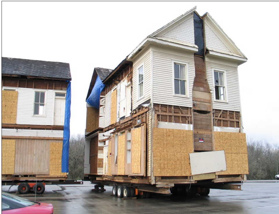
The Dew House made ready to move several miles on Highway 6. The L-shape of the house required it to be cut for the move or the "empty" square would have unbalanced the structure on a truck.

WARE: Do you remember how tall the house was when you moved it?