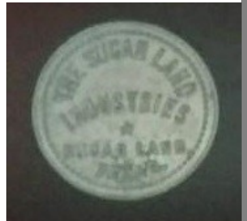
Metal token issued to employees of The Sugar Land Industries, Sugar Land, Texas, as partial or full salary. Use was restricted to the company store.

WHEELER: Everybody who lived there got paid by a special token that they made up, like dollar bills. It was mostly metal and they got paid with that. Imperial Sugar had everything. Hardware, they had horse and mule feed. They had one big metal building with all of the things, ladies clothes, men's clothes and residents had to use what they got paid with those coins. That was the only thing the shops would take.