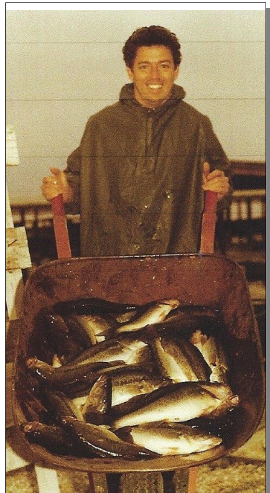
Buddy never saw a fish he didn't like. Shown here with a catch so big he needed a wheelbarrow after a successful day on the water.

WHEELER: What it was, Henry Hejl would lease a boat to you for one day, three bucks. It was a twelve or fourteen foot aluminum boat and in the middle seat he had a place for your bait to keep it alive. Most people would go down to the Intracoastal Canal and go into East Bay and some would go up to Lake Austin. It was about three or four miles to Lake Austin. A lot of redfish and we fished with trout lines, too.