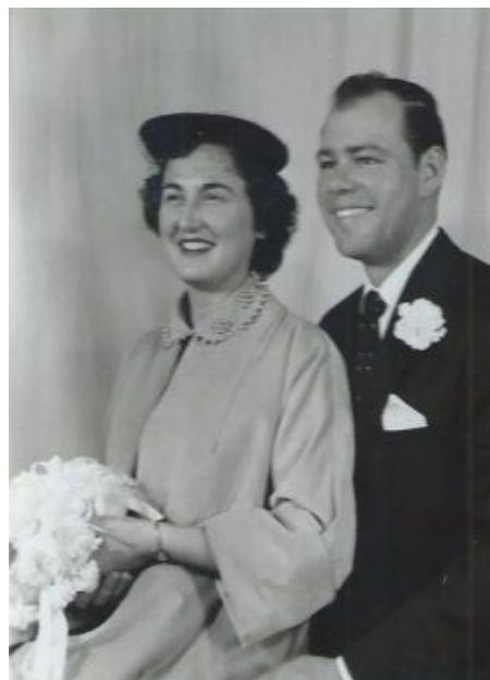
Wedding day in 1957

If you have a display of merchandise in a box and the customers are always selecting from the back, you are going to end up with some bad milk in the front. You better keep it rotated for the store owner so they all have good merchandise and you don't have to take any back.