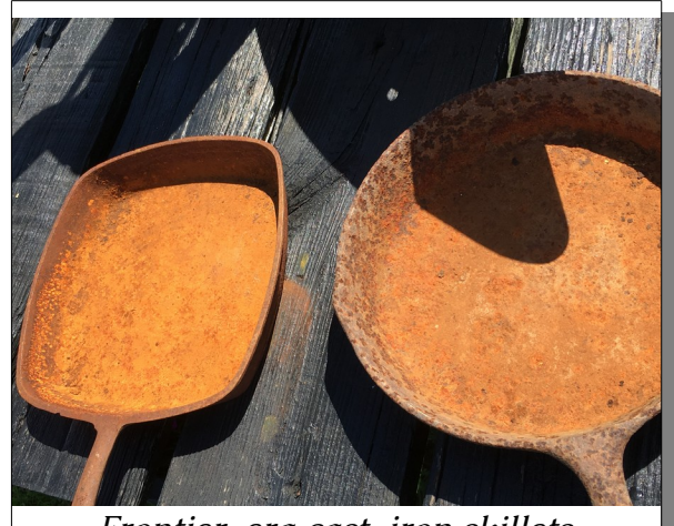
Frontier-era cast-iron skillets