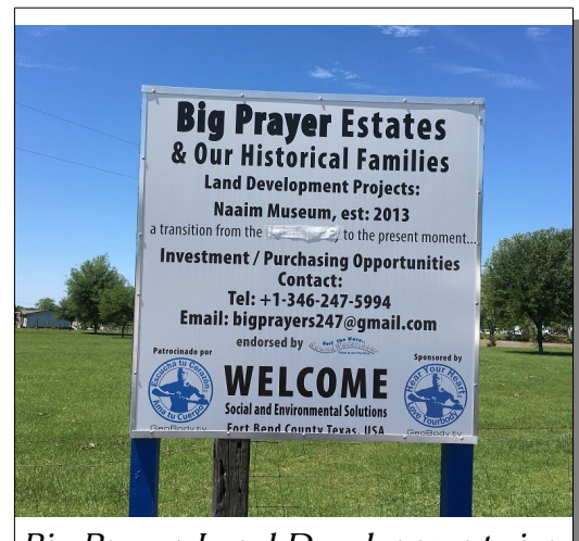
Big Prayer Land Development sign

GOODSILL: So much shame and bad memories related to slavery?