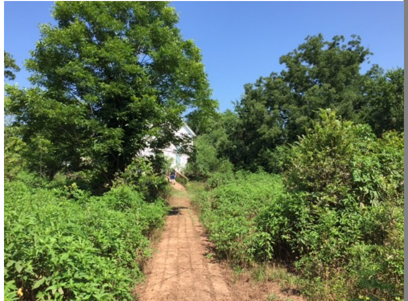
Dirt path leading through overgrown bushes to the rescued church. Note the large oak tree to the right of the path approaching the church.

So they built a non-denominational church. They put aside all their feelings about what they thought about their denominations...Baptist, Presbyterian, Methodist. They did it to thank God, and you just wonder, thank God for what? They had so little, and it makes us so grateful for what we have. They didn't have screens on the windows, and they didn't know that mosquitoes caused malaria and so many died. Yet, they praised God, and they took what they had. I think that settlement