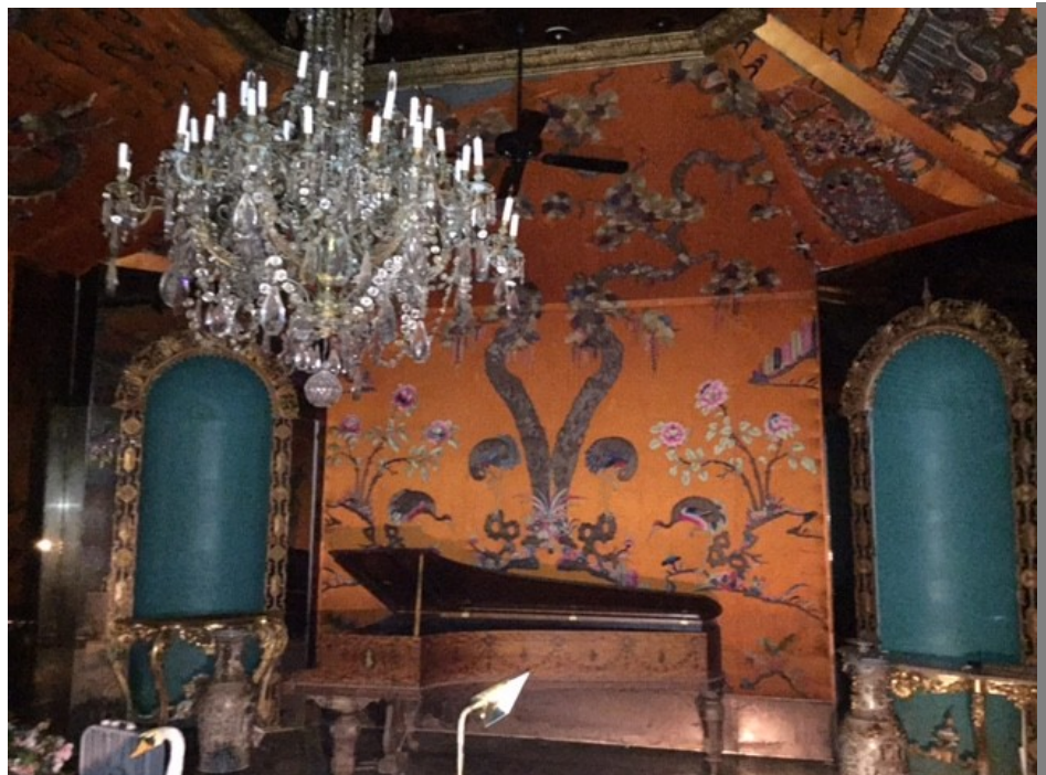
Asian silk wallpaper covering this room and ceiling was also flooded. A mirror in the ceiling reflects the chandelier and adds illumination to the room.