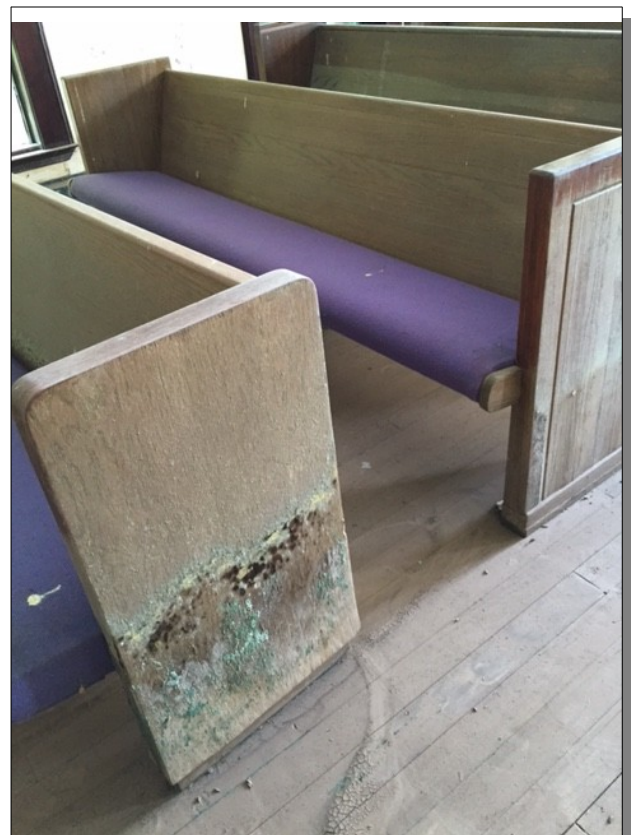
Pews for the church, complete with lavender seat cushions, were later damaged by flooding in 2016 and 2017.

There have been christenings, weddings and wonderful things in that little church. Single mothers in the country don’t have access to places to meet. I went to one of their lectures, and they said they had run out of money to hire a hall. So I said, “You can use the church.” So every Saturday morning they would come out and, honey, you should have seen them. They had on sequined shoes, they were dressed up to the nines, and some of them brought their children.