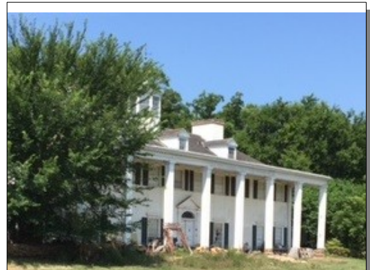
The Mt. Vernon-style home was moved from Memorial to Simonton and later damaged by flooding.