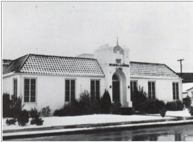
Sugar Land Clinic