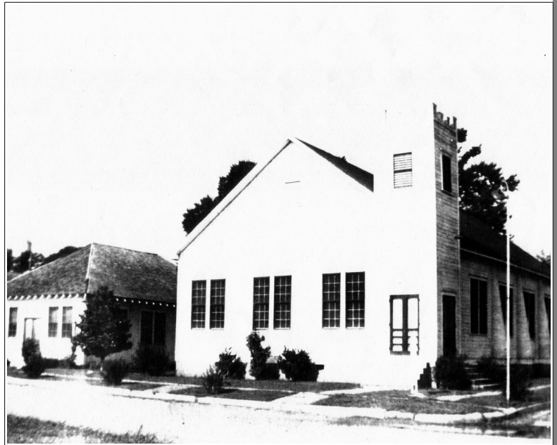
Baptist Church, 1914