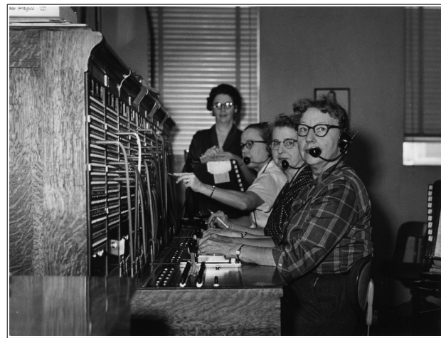
Sugar Land Telephone Switchboard