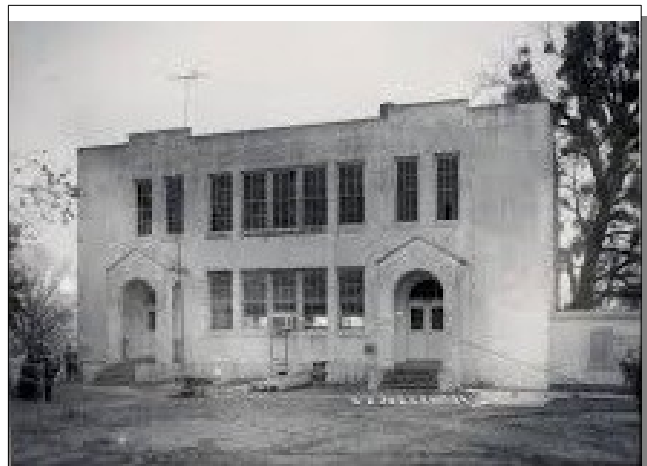
Simonton School, Simonton, Texas, was built in 1926. Classrooms were on the first floor, with an auditorium, stage, dressing rooms and kitchen above. The facility also hosted community dances, church services, elections, suppers, and home canning during the Great Depression. The building remains on its original site on FM 1093.