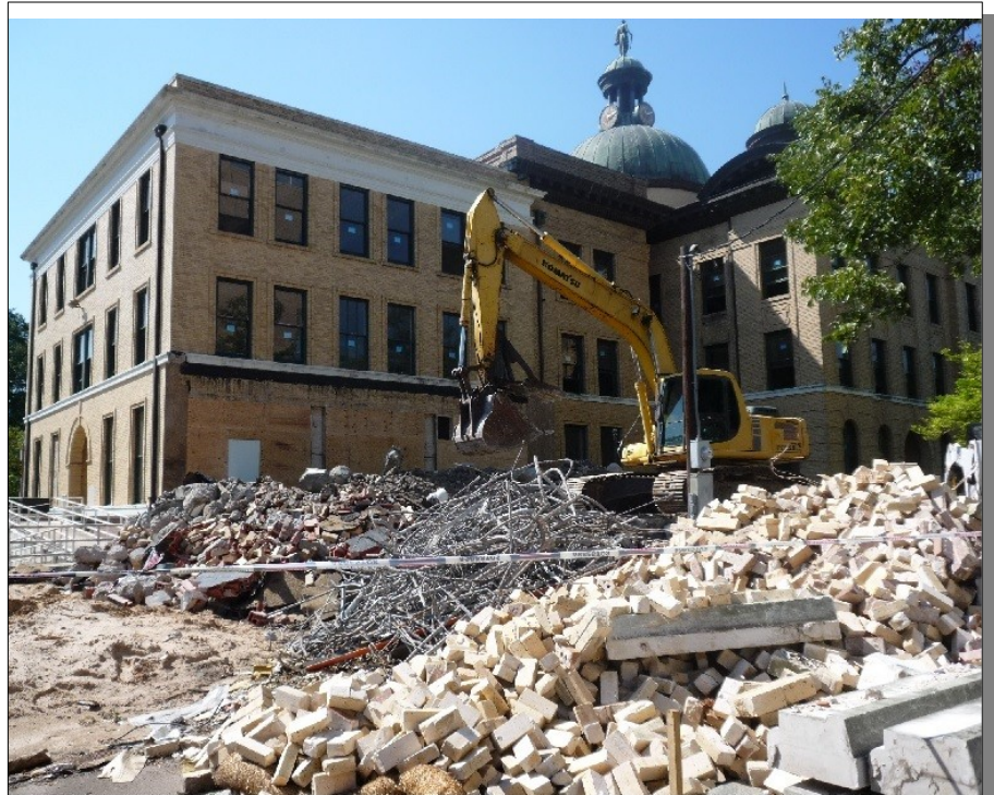
Rubble from the courthouse renovation. Much of the 1952 renovated coal tar roof softened in the heat and plugged drains on the roof. When rain water over-topped the flashing it drained into the building behind the parapet walls.

What we found when we got up here was that the original roof was coated with coal tar. In the heat, coal tar softens and flows. So, in time it flowed to the roof drains and plugged them off. The copper downspouts that you see were not just decorative, but they weren't functional because they were all plugged up with debris and coal tar.