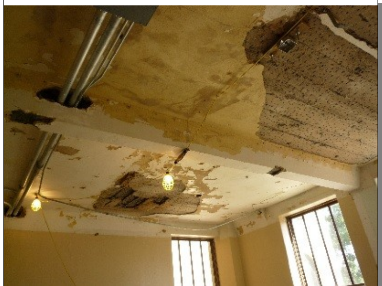
Basement ceiling showing conduit punched through structural beams and barred windows with bars.

These were some of the beams that I was talking about. Instead of bending around the beam, they just went right through so it had significantly weakened its intended support purpose.