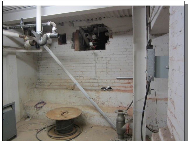
Basement 2 included a separate bathroom used by blacks beyond where the brick wall was back-filled some time in the past.

BRADY: It was on the west side of the building. I'll show you outside the judge's office where we think that was. This is more attic stock. Essentially this lower portion had been spalling and there was a lot of efflorescence, a lot of lime and a lot of leakage from the past. Records used to be stored here. The County Clerk would hand the guy interested in finding a record a key and he was on his own to come down here and rummage through boxes and boxes and boxes to find what he was looking for.