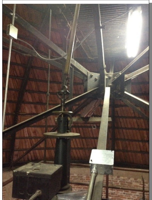
Interior of the FBC courthouse dome showing the profile framework.

This is all original brickwork on the lower section of the dome. The riveted iron struts and supports above the brick portion are covered with long leaf pine staves and the copper sheeting is hammered and attached over that.