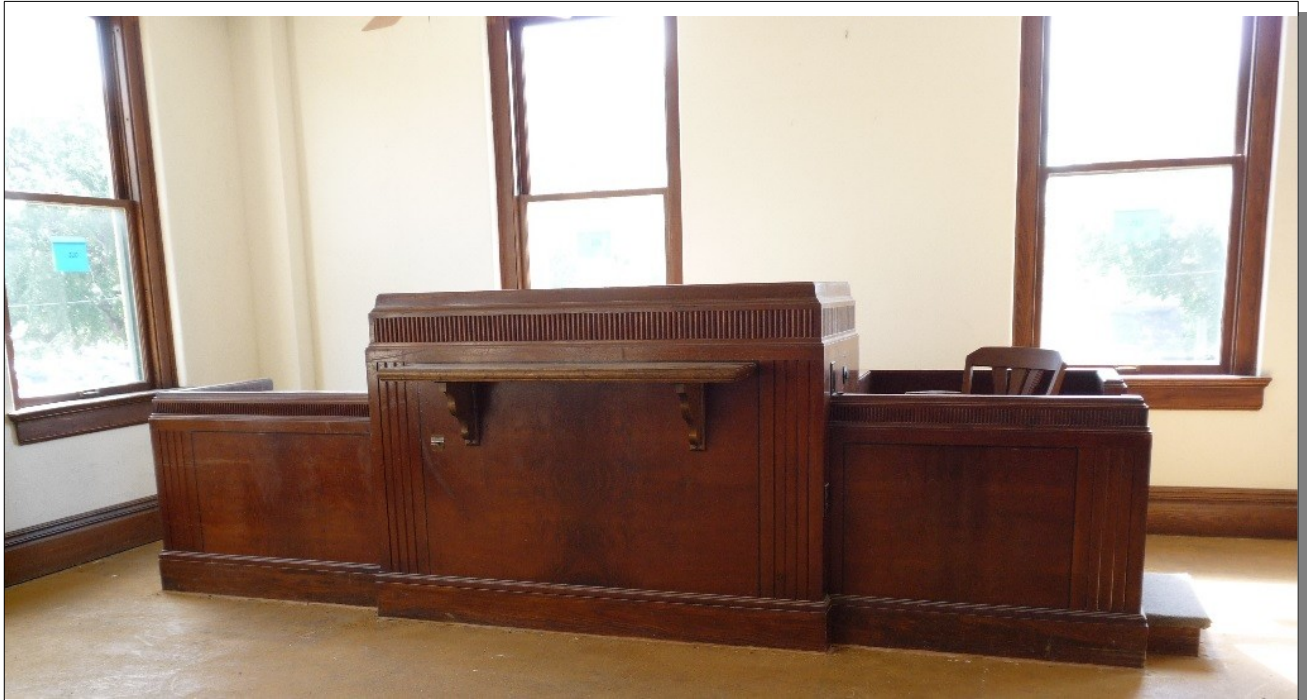
The original bench that was installed in the historic 240th District Courtroom and moved to the Fort Bend County Courthouse when a new bench was bought for the 240th.