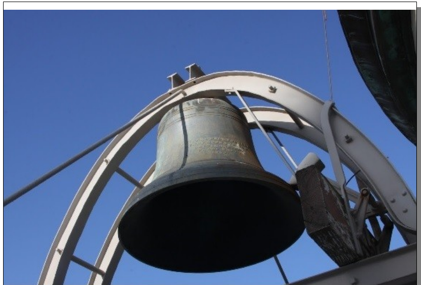
FBC Courthouse clock bell is mounted on the roof of the historic building and rings on the hour and half-hour.

Clock: The bell's gantry support has been sandblasted and repainted. We took the foam system off that vertical armature that you see is now sleeved so that we have protected it from the weather. The armature goes inside the dome to the clock mechanism. On the hour and half-hour the armature swings the hammer to strike the bell.