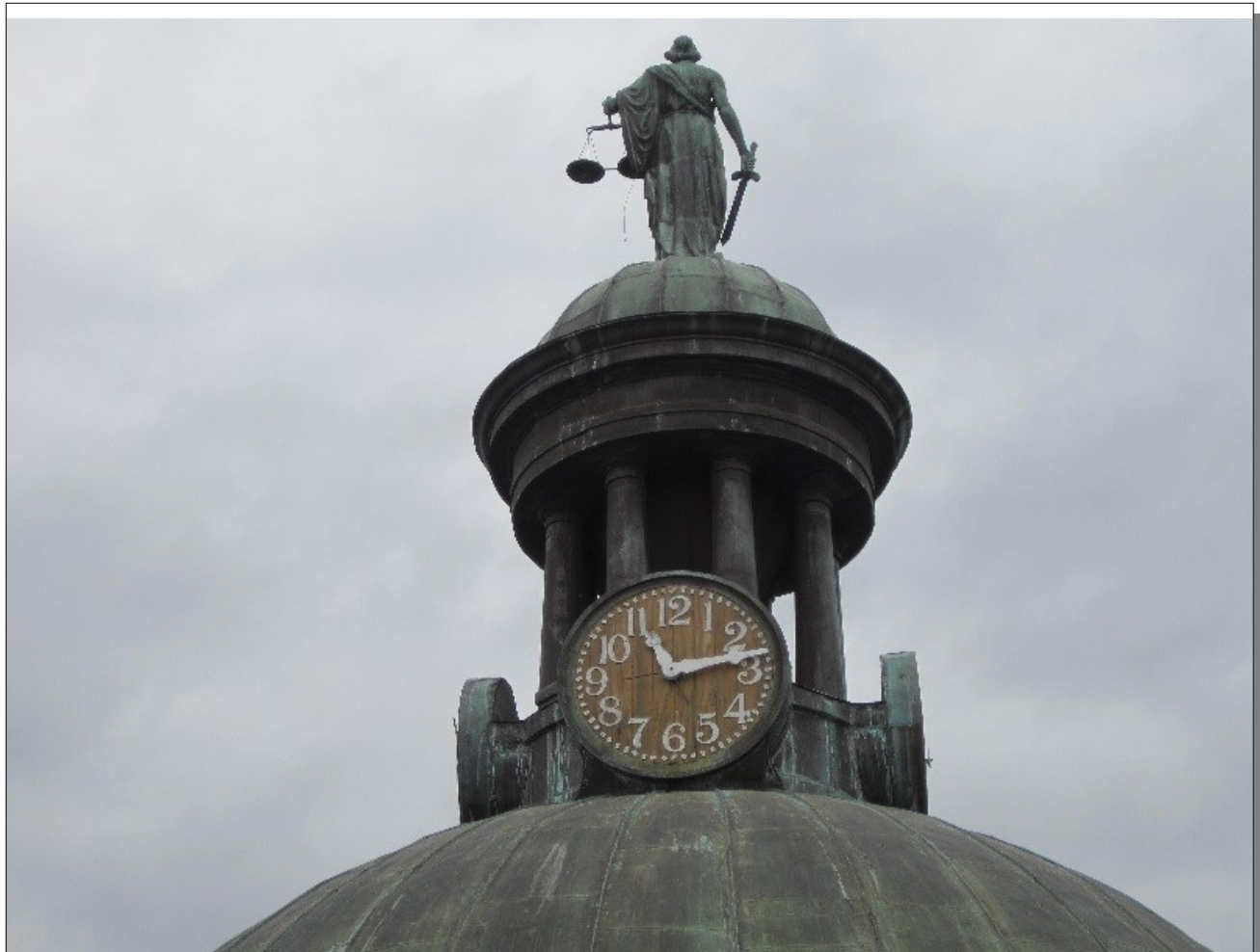
Statue of Lady Liberty above the historic Fort Bend County courthouse dome and showing the clock.

Since she is the high point, we've attached some of the wires to the frame that supports her. So she'll be saved as well.