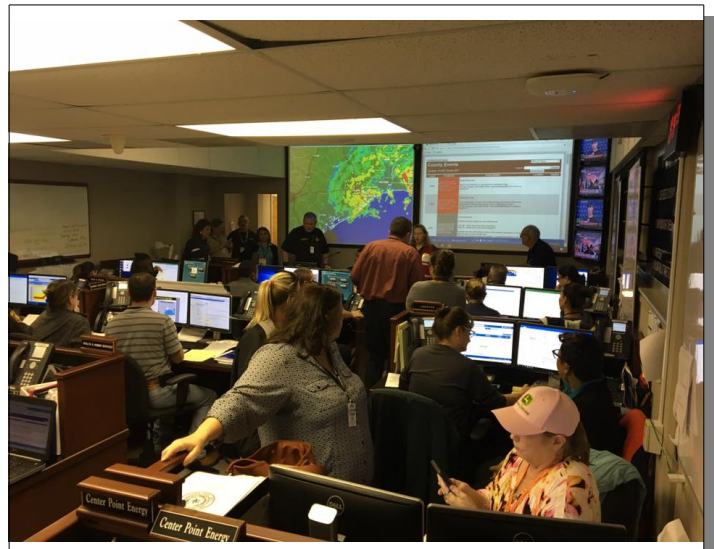
Fort Bend County Emergency Operations Center (Activated) for hurricane response.