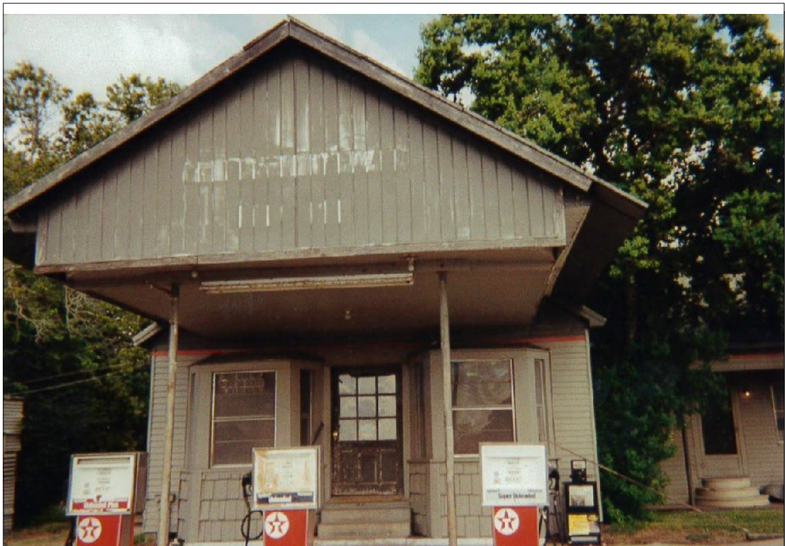
Renfrow Grocery Store and Gas Station at the corner of FM 521 and Trammel-Fresno Road.