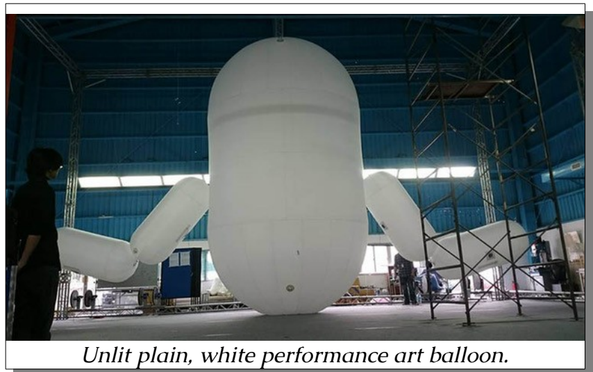
Unlit plain, white performance art balloon.

As you can see from these pictures, there is a plain white balloon, which has "arms" of a sort. During the performance images are reflected off this balloon and it seems to come alive. This same technology is also captured in a YouTube video called Shall we Dance Shanghai .