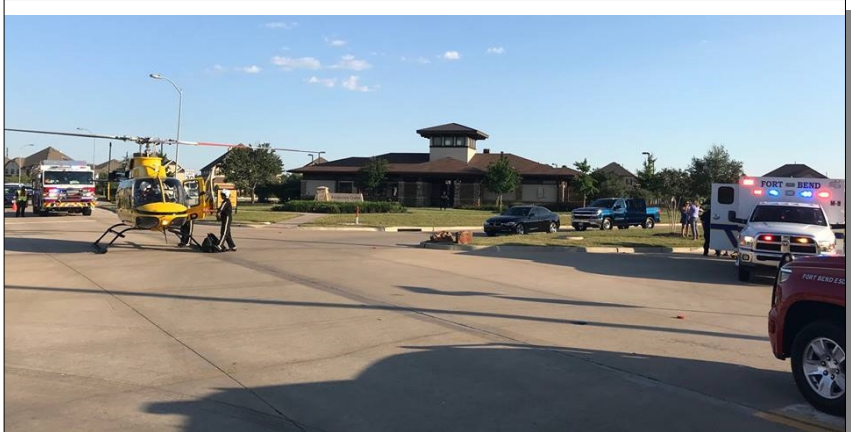
Oakbend Medical Center PHI Air Med 9 on scene with Fort Bend County Fire Department and EMS at an automobile vs. bicycle accident. Not pictured are FBC Sheriff's deputies blocking traffic behind the fire department and EMS.

HEBERT: It IS very expensive. It costs us about $1,200 to make a run and so many people are uninsured. If they have Medicare or Medicaid, we get about $350 back. BUT, the citizens like it. It's wonderful to know that no matter where you live in this county, within fifteen minutes of your location there is a response. It may be a