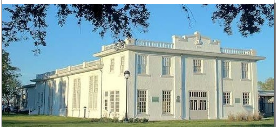
Lakeview Auditorium, later renamed Sugar Land Historical Auditorium, attended by Billy Stritch.

GOODSILL: Four or five years ago you came back to Sugar Land because they named the stage at the auditorium after you. You've been in HUGE venues and performed in front of thousands of people, and here you were, performing for about 300 of us. It