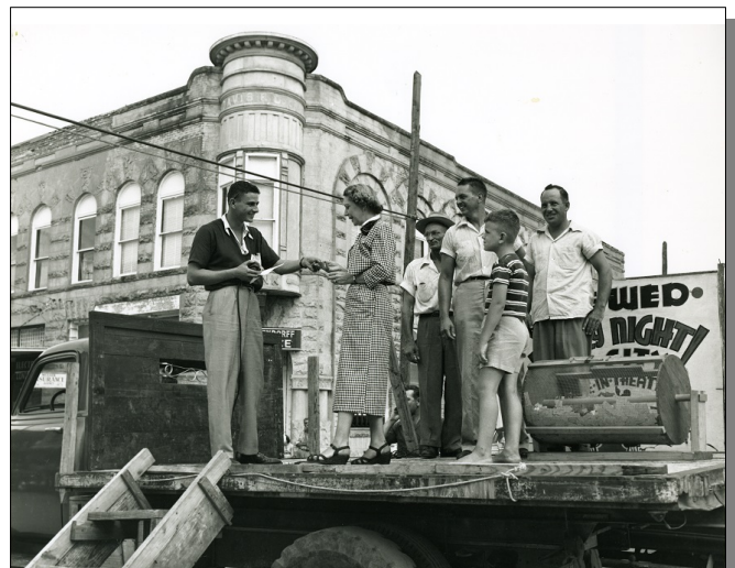
Drawing for groceries store owners contributed on the back of a flatbed truck.