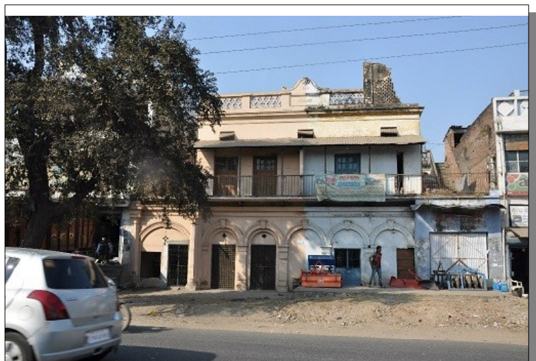
Ancestral home in Allahabad, India.