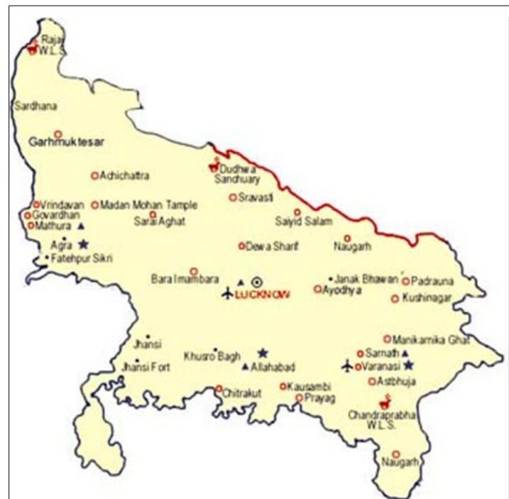
Map showing the cities, Lucknow and Allahabd, in India.