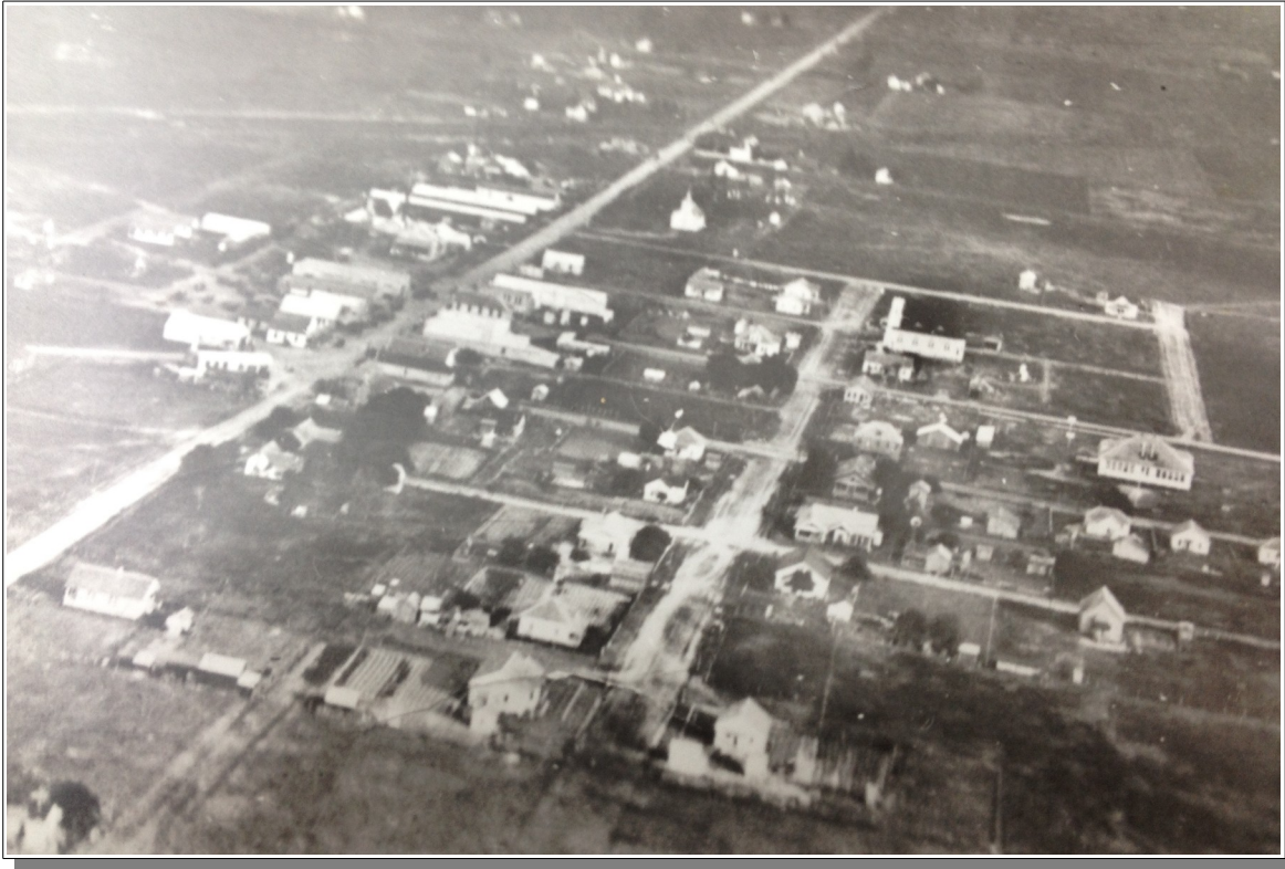
Needville, Texas. About 1925