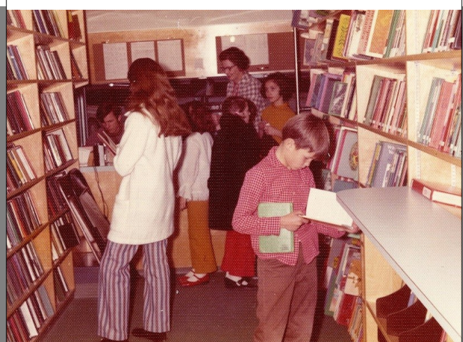
Patrons scoured the limited shelves for a good read when a bookmobile visited their community.

Eventually (and I don't have the dates) they were able to get two more bookmobiles, so there were three that were going. In 1974, they built the first two branches. At that time they were still operating in the building on US-90A, next to the hospital.