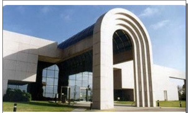
George Memorial Library, Richmond, Texas, built in 1986.

Then in 1986 the George Foundation purchased the land to build the George Memorial Library in Richmond because the existing library had become woefully inadequate. They contributed several hundred thousand dollars toward the building itself. This became the central location and is still a source of amazement to people who come out here.