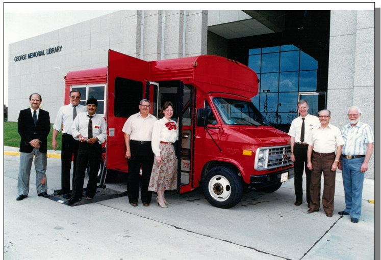
FBC staff pose with the third and final FBC Bookmobile outside the George Memorial Library.