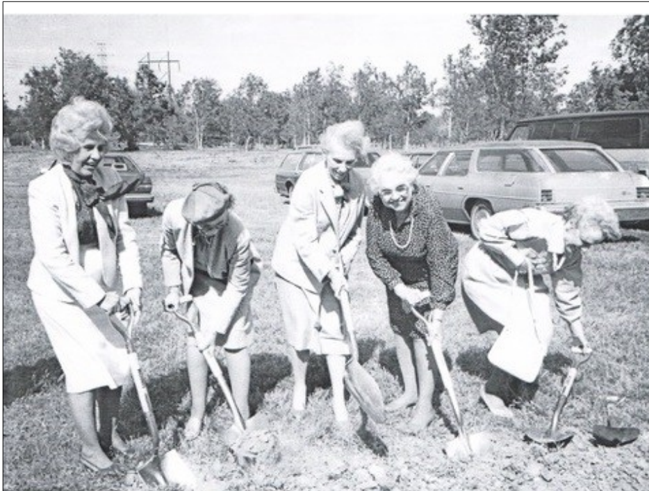
Five of the founding ladies of the Fort Bend County library system at the groundbreaking for the George Memorial Library in Richmond, Texas, ca. 1986. The ladies are identified in the text beneath this photo.