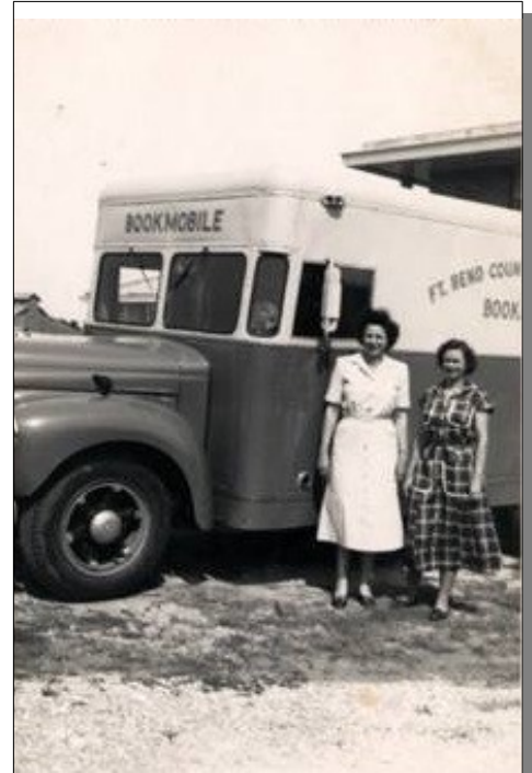
Librarians pose with second FBC Bookmobile, ca. 1950–52.

It's kind of remarkable to go back and look at the statistics for that period of time. The population of Fort Bend County in 1947 was approximately 32,000. Wharton County had approximately 33,000 and Brazoria had approximately 41,000. So the towns were considerably smaller than they are now. The population of Richmond was 2,030; Rosenberg had 3,457 people with 128 businesses – it was the largest town in the county. Missouri City had 100 people; Stafford had 400; Sugar Land had 1,500–2,000. I could not get a number on Katy. Needville had 500–600 people. So you can see Needville was larger than Stafford or Missouri City at that time. Beasley had 200–300; Orchard had 200; Fulshear had 100–200 and Simonton had 150–200. That was remarkable to me. As for the libraries in the surrounding counties in the mid-1940s, Brazoria had established theirs in 1941 and by 1946 they had a library in Angleton and branches in Alvin and Freeport. AND they had a bookmobile.