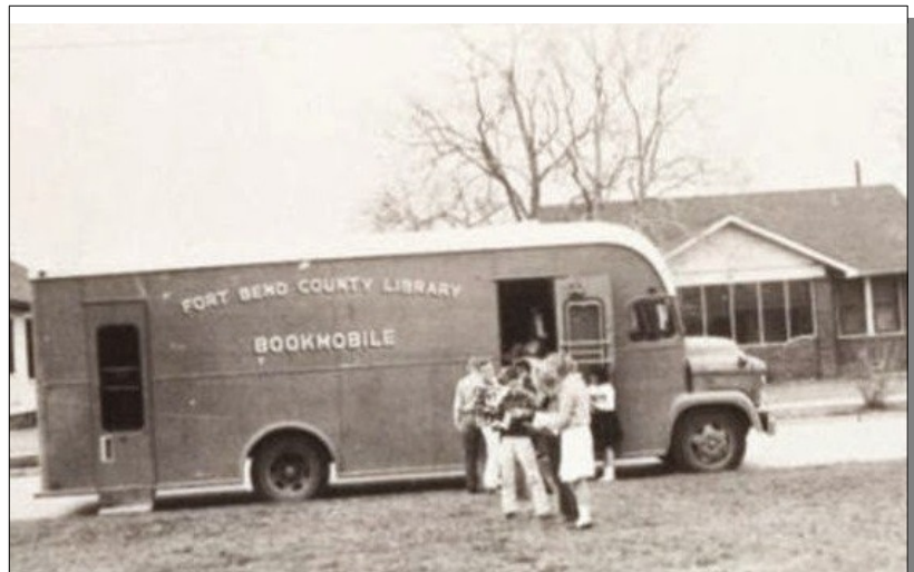
Going to the Bookmobile.