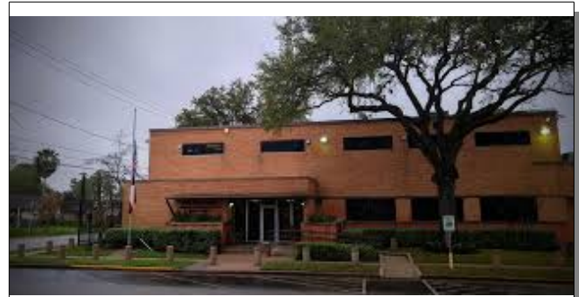
Renovated Fort Bend County Office of Emergency Management, 307 Fort Street, Richmond, Texas 77469. Formerly the FBC Jail and later the FBC Juvenile Facility.

JAN: That was the next thing I was going to say. When we went through that transformation there were times when I was in the Operations Room pointing to a portion of ceiling that had been raised. It was a concrete, wire mesh ceiling. There were times when things were crashing and we weren't sure what was happening. We actually had to move that thick concrete wall four feet back. Everything was solid cinder block and steel. It is probably the best building to be in during a hurricane!