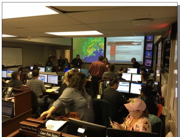
Fort Bend County Emergency Operations Center (Activated) for hurricane response.