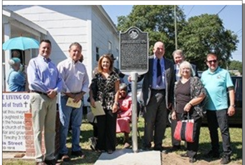
Church Of The Living God, Pillar And Ground Of Truth - Richmond, TX. Texas State Historical Marker dedicated on 8/12/2017.