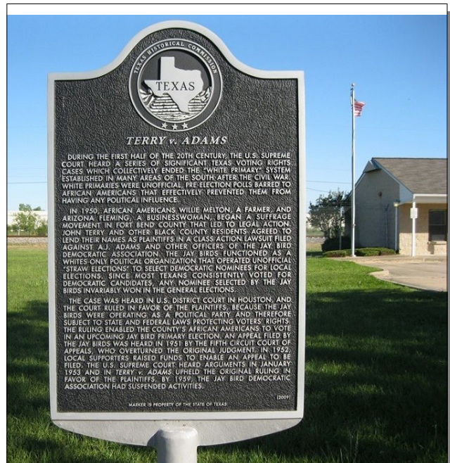
A Texas Historical Marker was installed next to the US Post Office (background) in Kendleton, Texas, the hometown of the plaintiffs in the US Supreme Court case.